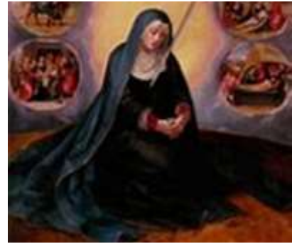
Feast of Our Lady of Sorrows