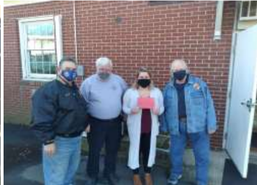
Church of God Children's Home