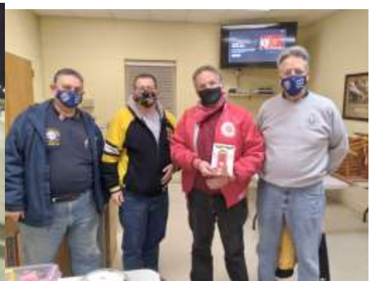
Salvation Army Homeless Shelter