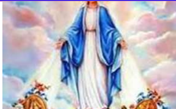
Month of Mary