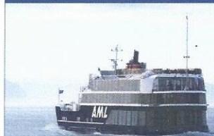
Cruise on the stunning St. Lawrence River