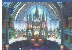
See Montréal's beautiful Notre Dame Basilica