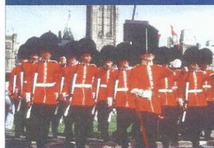
Visit World Famous Parliament Hill