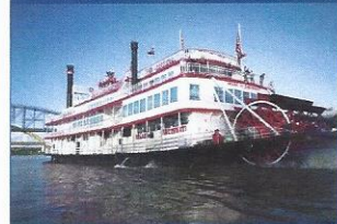
Enjoy a BB Riverboats Sightseeing Cruise