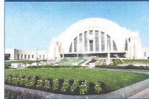
Incredible Cincinnati Museum Center, including an Omnimax Show