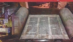
View from Inside the Ark Encounter

$75 Due Upon Signing. *Price per person, based on double occupancy. Add $179 for single occupancy. Final Payment Due: 7/31/2024