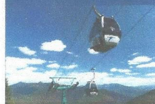
Experience a 1.3 Mile Scenic Gondola Ride