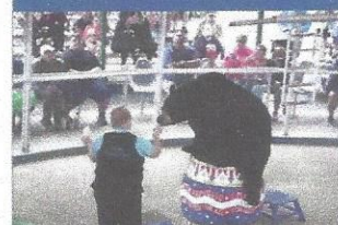
See a Live Bear Show

$75 Due Upon Signing, *Price per person, based on double occupancy. Add $349 for single occupancy. Final Payment Due: 7/12/2024