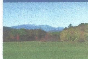
Picturesque Views of New Hampshire