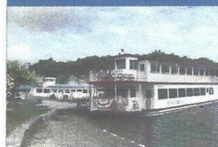
Scenic Narrated Cruise on Lake Sunapee