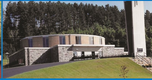
St Martin's Catholic Church