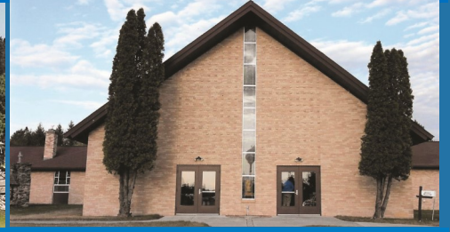
St Mary's Catholic Church