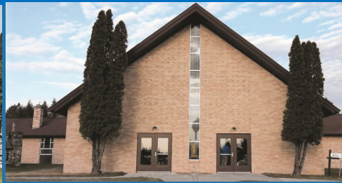
St Mary's Catholic Church