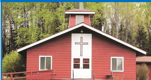
Holy Cross Catholic Church