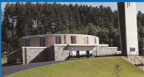
St Martin's Catholic Church