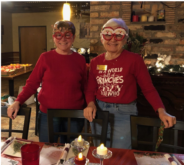
Christmas Party December 13, 2021