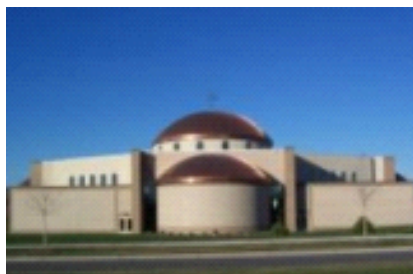
St. Michael Catholic Church St. Michael, Minnesota

www.stmcatholicchurch.org/faith-formation/