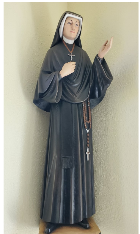
New statue of St Faustina in the Immaculate Heart social hall