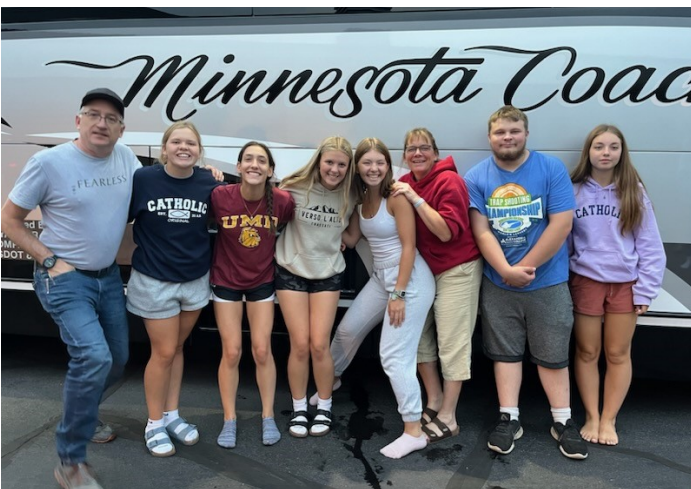
Steubenville Conference crew 2023