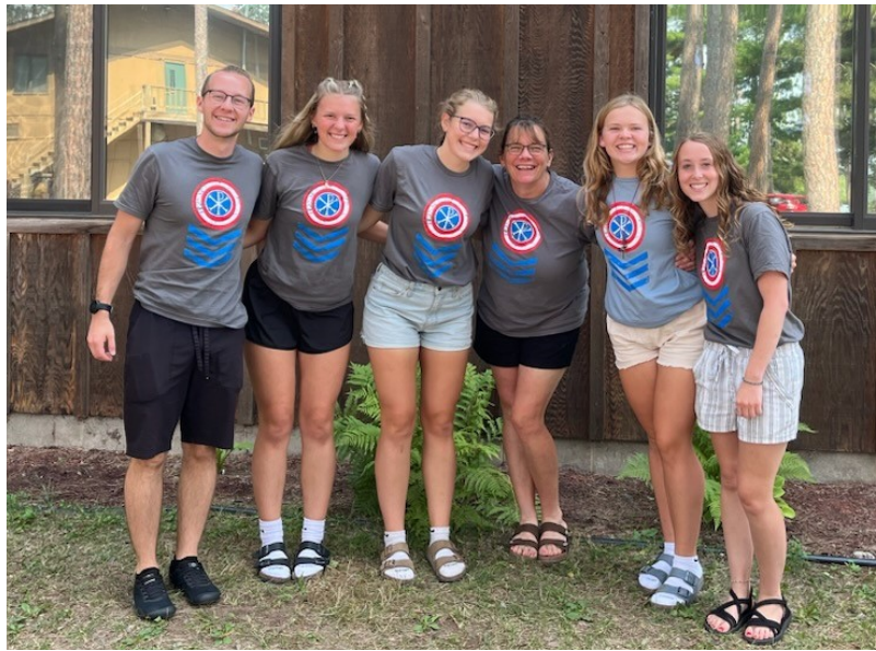
IHC students and alumni helping at Camp Survive week 2