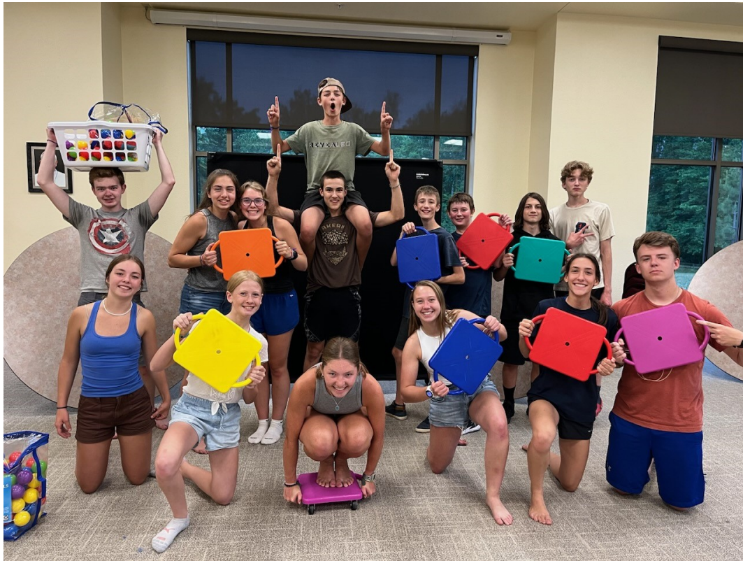
Totus Tuus high school program