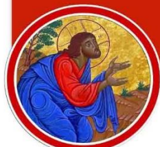
1.The agony in The garden