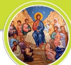
3.The proclamation of the kingdom of God