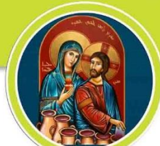
2.The wedding feast of Cana