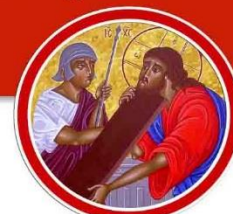
4.The carrying of the cross