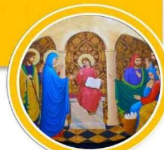
5.The finding of Jesus in the temple