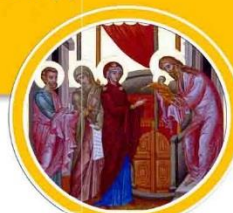
4.The presentation in the Temple