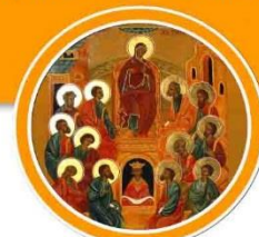
3.The descent of the Holy Spirit