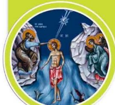
1.The baptism in the Jordan