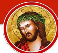
3.The crowning with thorns