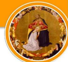
5.The crowning of Our Lady