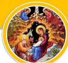
3.The birth of Our Lord