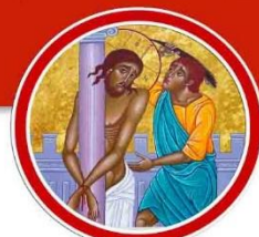
2.The scourging at the pillar