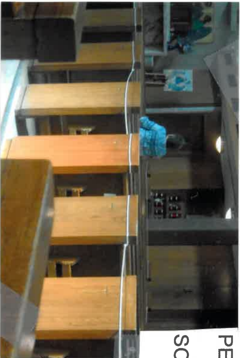
PEWS ROPED FOR SOCIAL DISTANCING