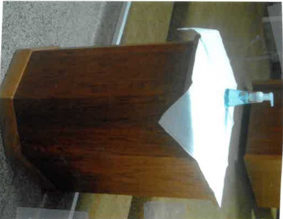
BE SURE TO WASH YOUR HANDS