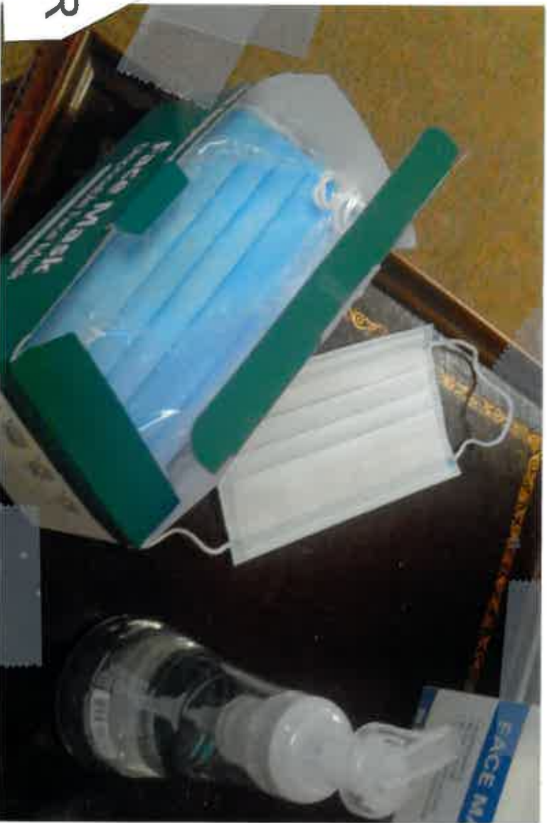
MASKS AND HAND SANITIZER