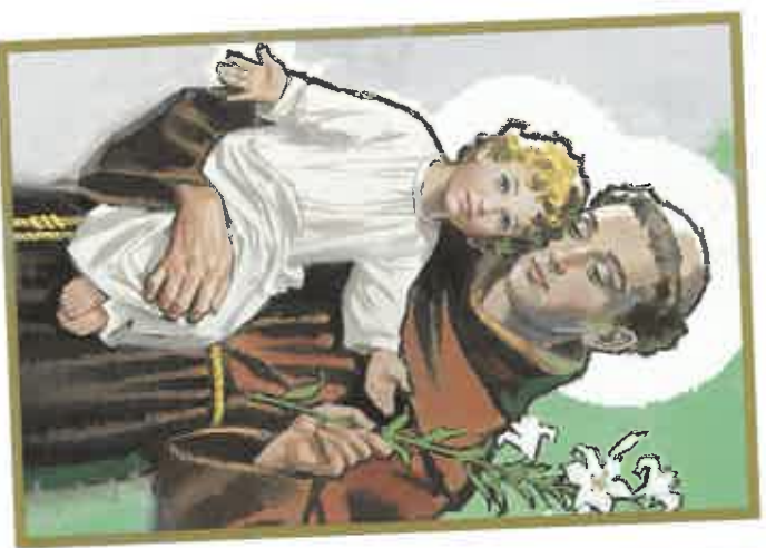
St. Anthony Pray for Us

God is just a prayer away. This little card will be a humble source of inspiration.