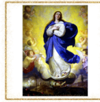
Immaculate Conception of Mary $1,005.00