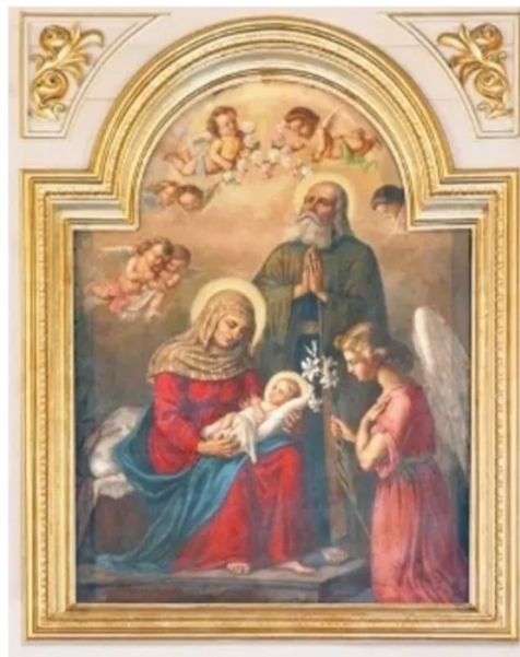
Feast of the Nativity of the Blessed Virgin Mary September 8

Let your face shine upon your servant; and teach me your laws.