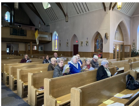
Creche Service ~ January 14, 2024