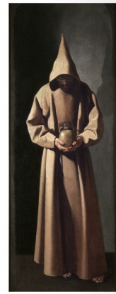
Artist: Francisco de Zurbarán

Welcome, Sister Death Praying for Our Deceased Brothers and Sisters