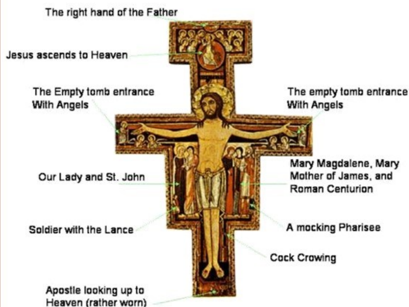
The San Damiano Crucifix