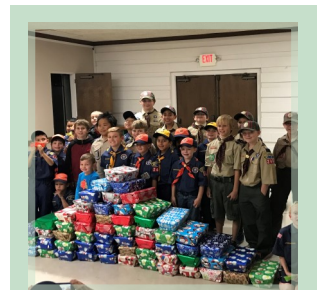
Alpha project w/ Scouts

In different ways—prior to kids, I was a registered nurse but took time off to raise a family. With the military I've been an Ombudsman—someone who serves as a liaison between families and command. My boys are in Cub Scouts, and I am their den leader and a committee chair that helps plan fun activities. Scouts allows my family to learn about service and serve together. At St. B's I'm the 5th grade catechist and also help with Children's Liturgy; both of these have taught me so much. Our Scout pack also provides hospitality after the Sunday Masses quarterly; this is a great way to bridge Scouts and the Church and to give back.