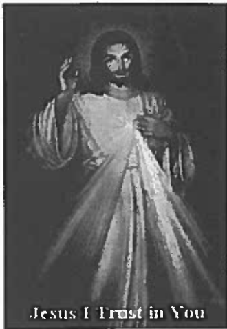
Jesus I Trust in You