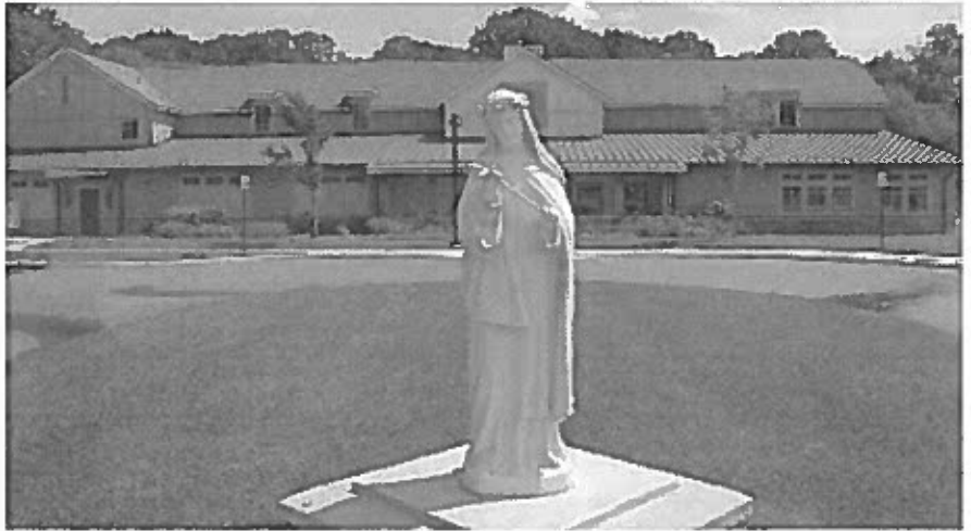
St. Rose of Lima Retirement Villa - Dedicated August 2010