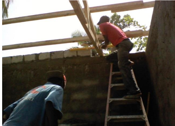
Setting the trusses