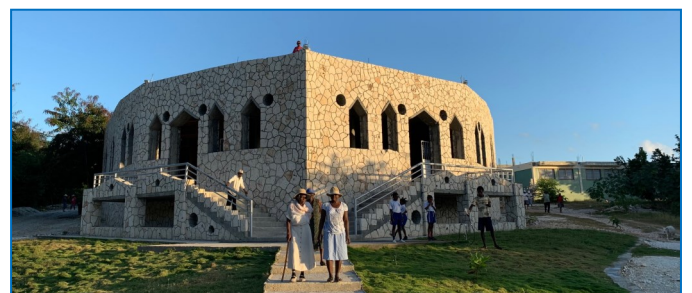
January 2021- The substantially completed Our Lady of the Assumption church