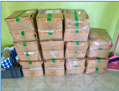
(Cases of solar lights in the storage depot waiting to be unpacked "to light up the hills!")

The Family Distribution is always one of the highlights of a mission trip. An average of 150 families are selected each trip to be the recipients of groceries, various supplies and $20 in cash by way of our "Dirty Card helping Families" project. The past few years, one of the friends of HMI who visited Haiti on a mission trips was inspired to research solar lights in order that the families - especially the children - could have light to live by. Once a decision was made on the most suitable for the situation in Haiti, with both personal commitment on the part of this individual and participation by some friends, the solar light project was born. Has it ever been a success! All the families greatly appreciate what they receive from the team, but the solar lights are particularly precious. For a while, it seemed as though the lights would not arrive in time this year for the distribution. How exciting it was for the team to see the cases of lights show up in the storage depot the day before the distribution day. Thanks be to God!