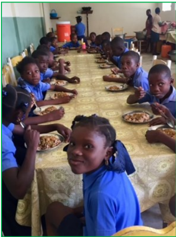
Happy, healthy, smiling faces. It wasn't always like this. Without your help it would be a much different story.

Over the last two months we collected extra donations dedicated towards Teacher Support and Feeding the Children. We received donations totaling $6,722. Of the total, $4,700 will be utilized for Teacher Support and $2,022 for Feeding the Children. These funds will be placed in restricted accounts for use in the 2023-24 school year. Thank you to all our generous supporters. If you would like to make additional donations during the year you can do so online with the designated tab on the HMI website or by mailing a check with a note designated where you would like your donation to be utilized. We would also like to once again thank our dedicated monthly donors who contribute nearly 30% of the funds needed to keep St. Bridget School-Numero Deux open for approximately 230 students and 15 staff members. (Please keep all our friends in Haiti in your prayers. The fuel and supplies crisis has had a great impact on many in the Numero Deux area. It has forced HMI to cancel the November Mission trip. We hope and pray for improvement soon. In the meantime, we have sent some humanitarian support in November to those we can help.) HMI Teacher Support & Feeding the Children