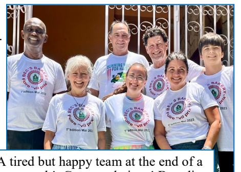
A tired but happy team at the end of a Busy week! Congratulations! Bon dieu Beni ou! May God bless you!

Medical Clinic that a nurse comes to regularly but more recently, more attention has been given to helping the never ending requests for medical assistance.