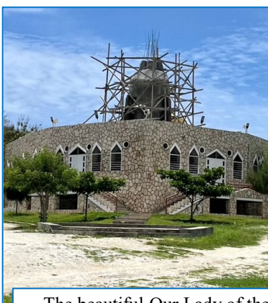
The beautiful Our Lady of the Assumption church serving its purpose of taking care of the spiritual and physical needs of the community