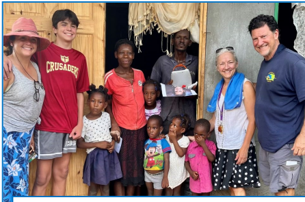
One of the 30 houses that were dedicated. Note The dad holding a solar lantern – lot’s of joy!