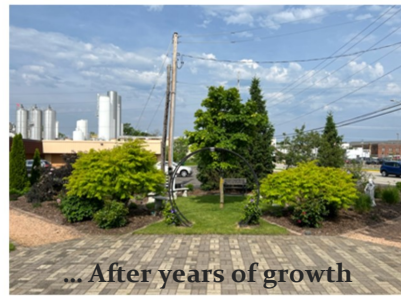
... After years of growth