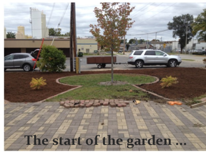
The start of the garden ...