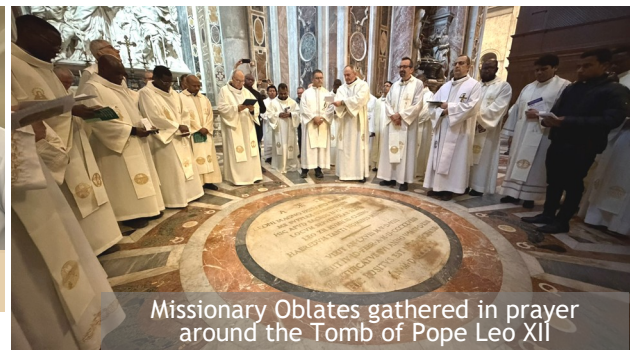
Missionary Oblates gathered in prayer around the Tomb of Pope Leo XII