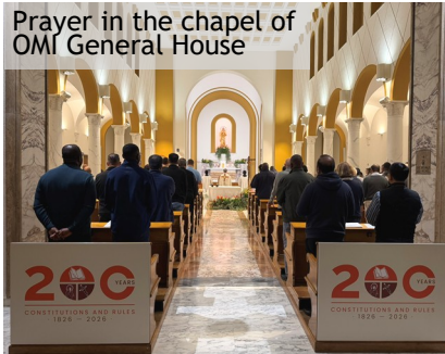
Prayer in the chapel of OMI General House

On the morning of February 17, we gathered in the OMI General House chapel for meditation and extended adoration of the Blessed Sacrament. It was a profoundly