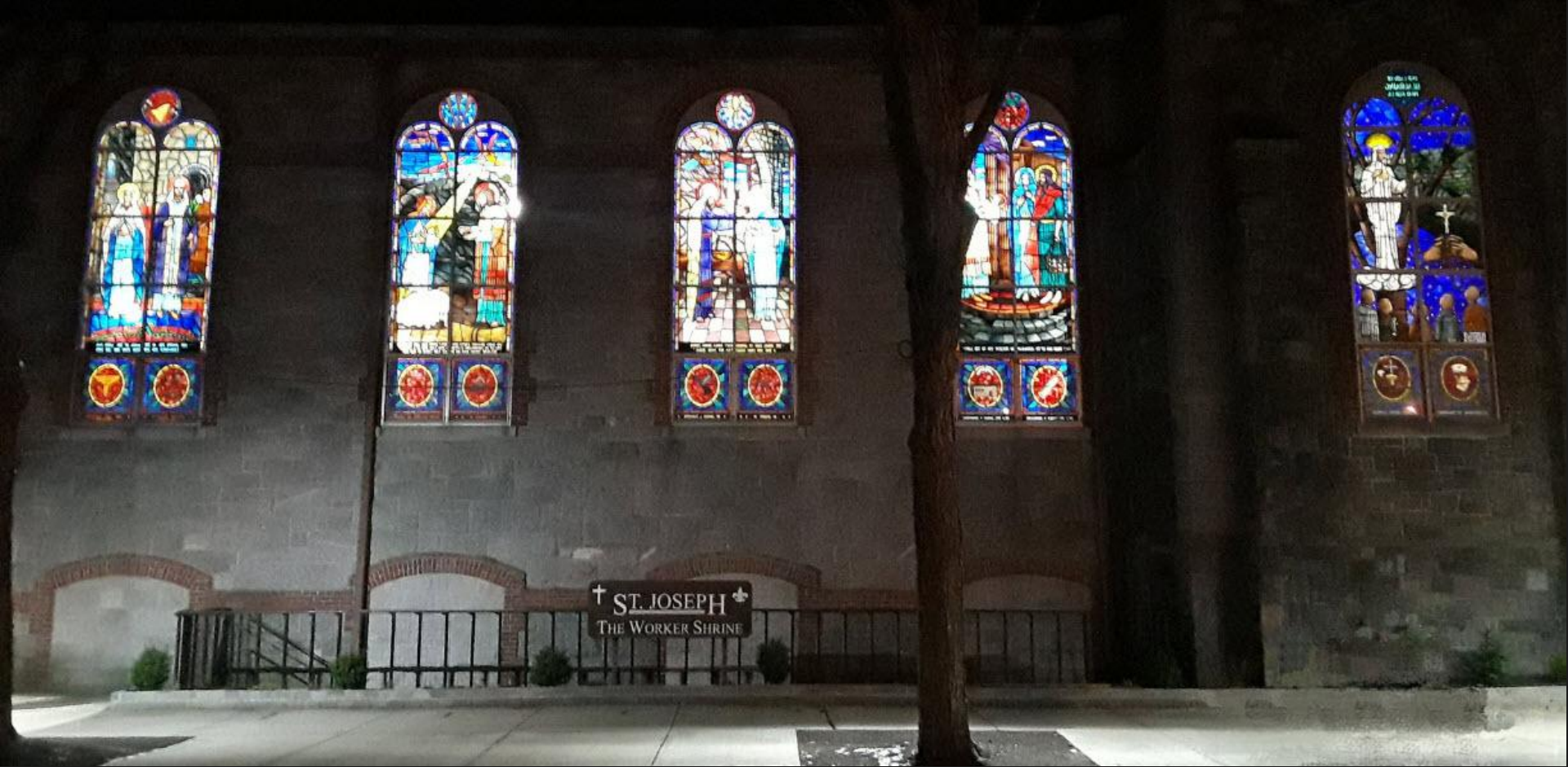
Praying with the Windows of St. Joseph the Worker Shrine