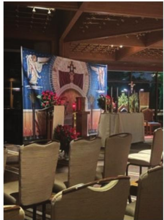
Prayers for the SJB faithful at the convocation chapel