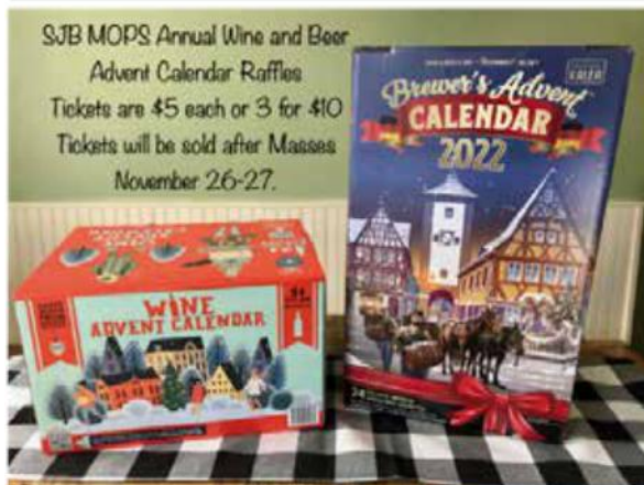
SJB MOPS Annual Wine and Beer Advent Calendar Raffles Tickets are $45 each or 3 for $10 Tickets will be sold after Masses November 26-27.