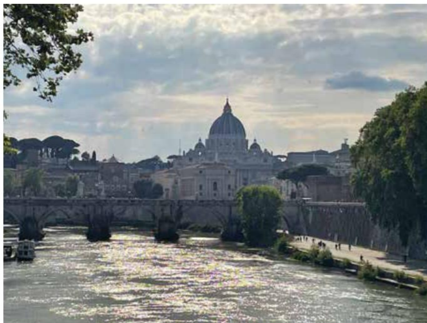
St. Peter's, Vatican City, Rome, Italy.

Photographer credit given to Fr. Jim Olofson. Thanks, Fr. Jim!