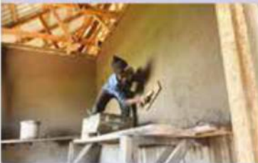
A contractor works on the plastering of the interior walls.