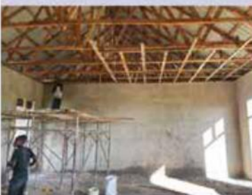
While the interior plaster is drying, preparation of the ceiling continues.