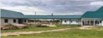
The new therapy building (left) is now connected to the outpatient clinic (right).