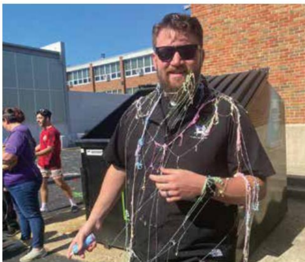
St. John the Baptist Catholic Grade School traditions on the last day of school!