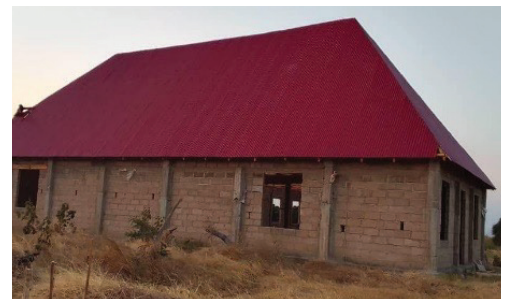
New Roof for Parish in Kijombe

"We will have more information to share with you about the 2023-24 campaign next week." 4.