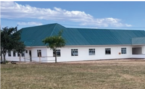
New therapy building – 9,400 Sq Ft.

We'd like to thank you for your support last year!