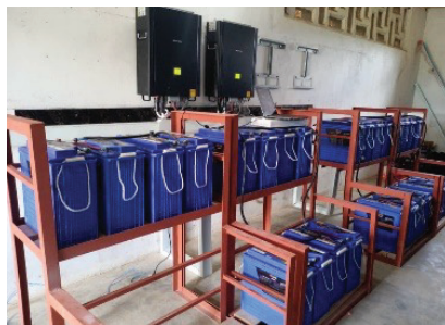
Solar Power Improvements