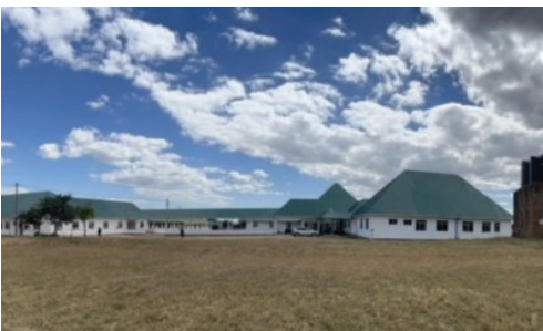
INUKA Recent Construction (14,500 Sq. Ft.) – Therapy Building (Left); Outpatient Clinic (Right)

Campaign Funding Goal: $150,000 Funds raised and sent to Fr. Nestor: $198,000!