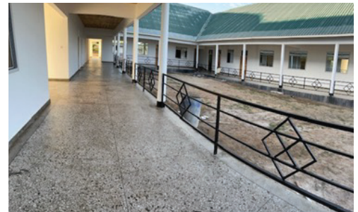
Therapy building hallway and courtyard