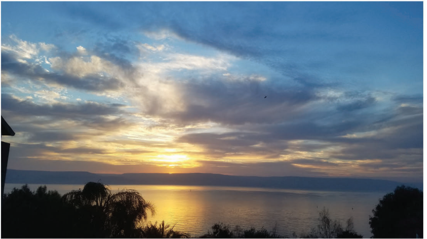
Sunrise on the Sea of Galilee