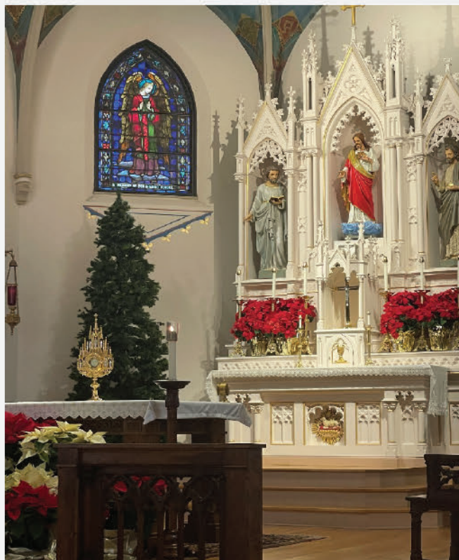
Adoration at St. John's

https://prayers4reparation.wordpress.com/2012/04/21/things-to-do-during-eucharistic-adoration/