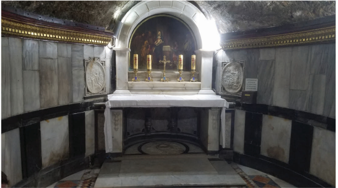
Chapel of St. John the Baptist