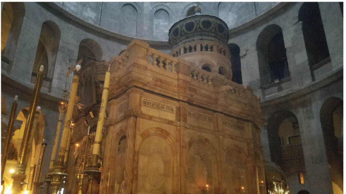
Church of the Holy Sepulchre-Empty Tomb