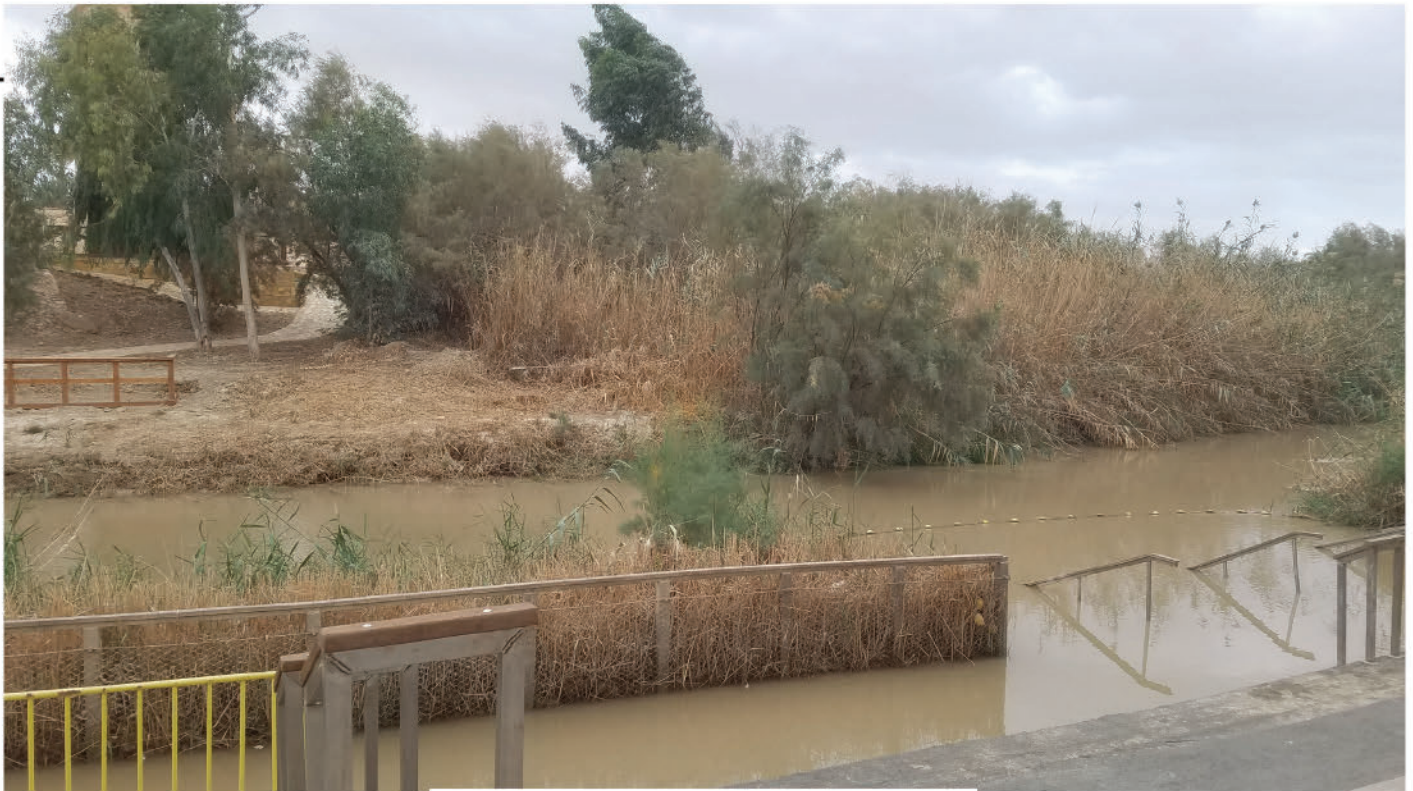
Baptismal Site-Jordan River