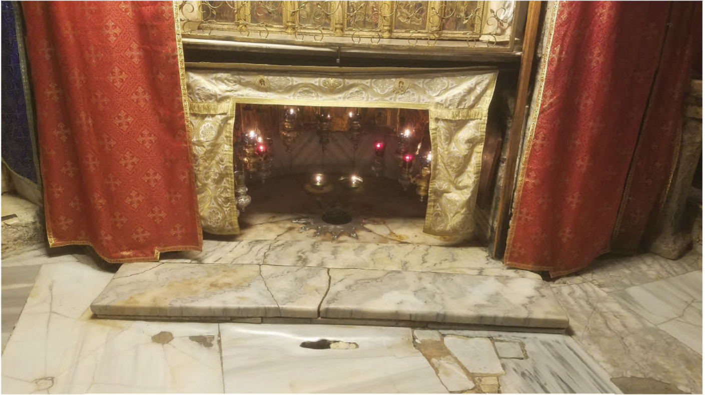
Bethlehem-Site of Nativity