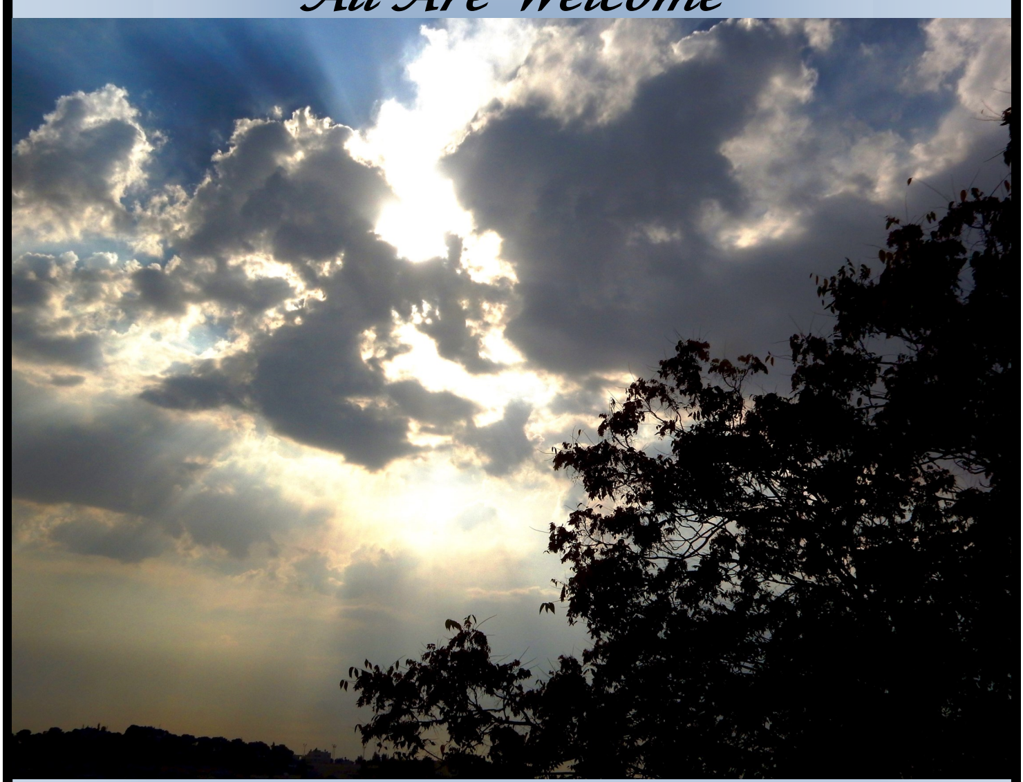
A bright cloud casts light and shadows over Jerusalem

While he was still speaking, behold, a bright cloud cast a shadow over them, then from the cloud came a voice that said, "This is my beloved Son, with whom I am well pleased; listen to him." (Mt. 17:5)