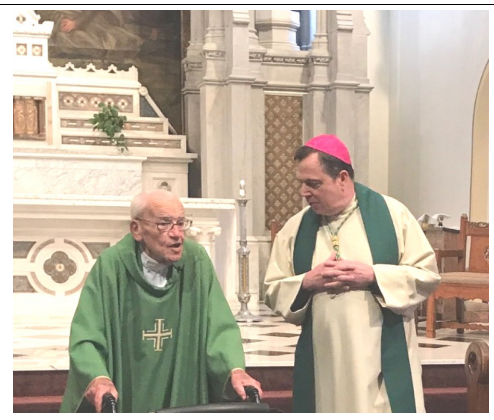
Two former missionaries confer after Mass at Immaculate Conception Church this past weekend.

Our next Youth Mass is Sunday, September 24 at Nativity, Merrimac at 5:00pm.