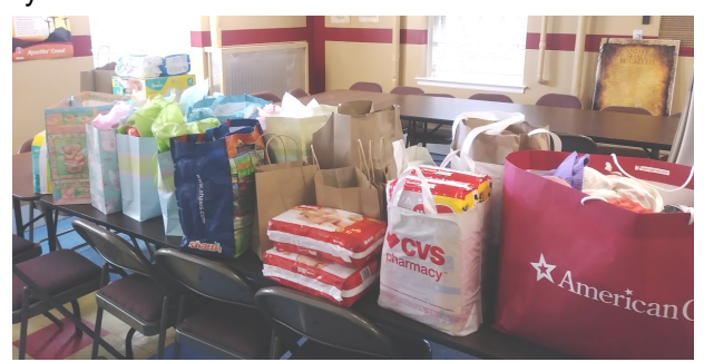
Some of the items collected for the "Baby Shower" for the Pregnancy Care Center

The Pregnancy Care Center is very grateful for all of the baby items that were delivered to them on behalf of the Religious Ed students. Thanks to everyone for making our "Baby Shower" a success.