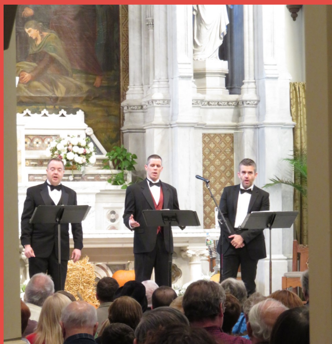
Scene from last year's wonderful show.

{Proceeds benefit the IC Society of St. Vincent de Paul}.