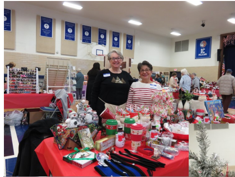
Many items to choose from at the fair.