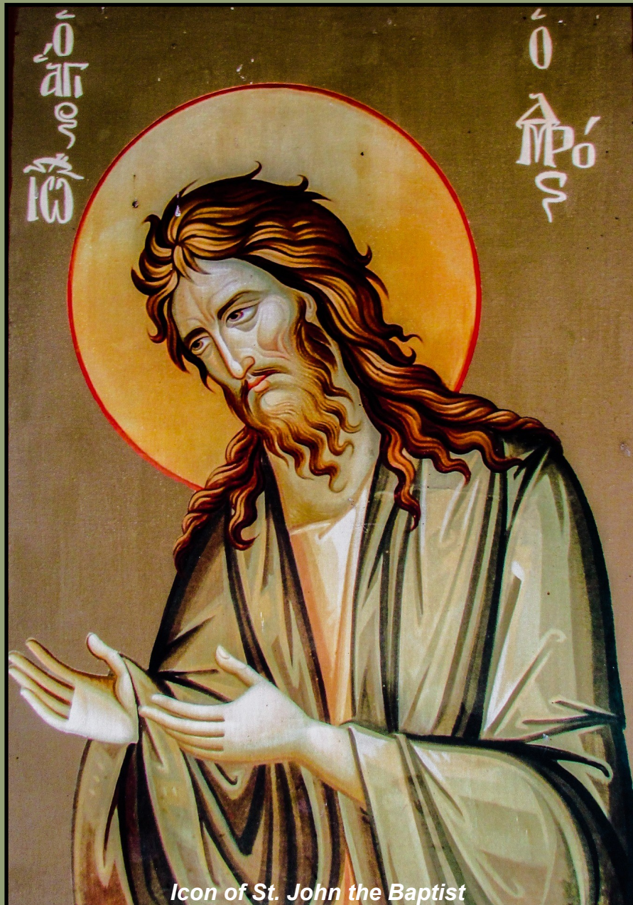
Icon of St. John the Baptist

“John went throughout the whole region of the Jordan, proclaiming a baptism of repentance for the forgiveness of sins” (Lk 3:2-3)