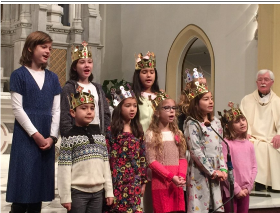
The IC Children's Choir performing at the 9:00 Mass on the feast of Christ the King.

Remember when submitting your CORI form by mail, a picture ID must also be submitted for verification purposes.