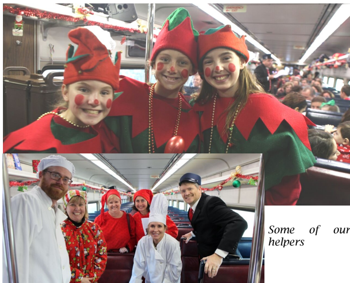
Some of our helpers