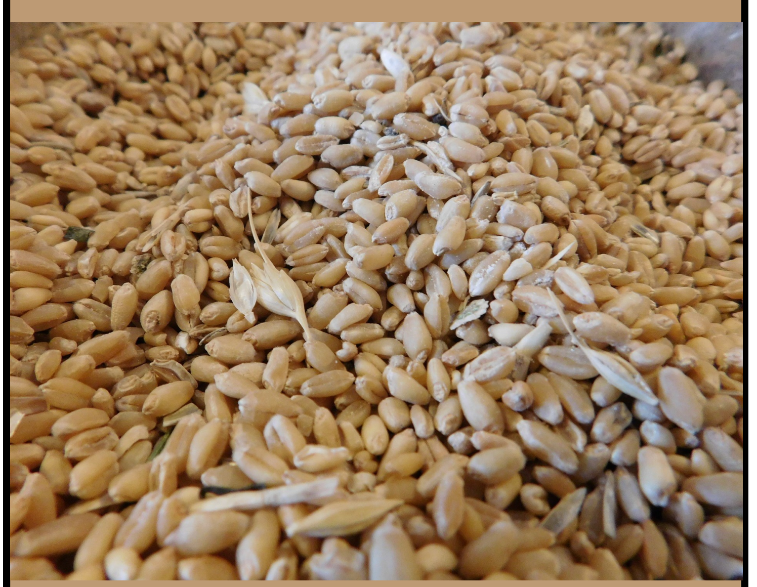
Amen, amen, I say to you, unless a grain of wheat falls to the ground and dies, it remains just a grain of wheat; but if it dies, it produces much fruit. (Jn 12:24)