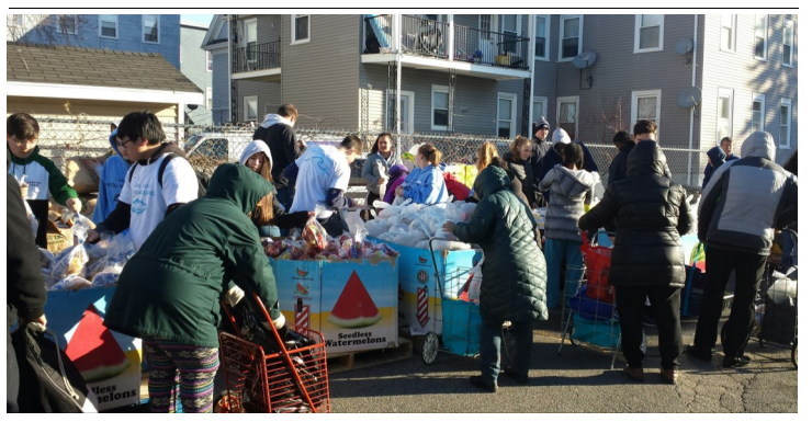
Teens participating in the annual Hunger for Justice weekend retreat helped out at the Lynn Mobile Food Market sponsored by Catholic Charities. On Holy Saturday morning they distributed food and care packs to hundreds of grateful people.

Prior to Mass, a beach clean up day is scheduled from 2:00–4:00pm at the North End of Plum Island. Please bring trash bags and disposable gloves. This activity is open to families. A permission form is required for any teens not accompanied by an adult. Form to be posted to the website in Youth Mass section of page: <u>hriccatholic.org/Youth-Ministry</u>.