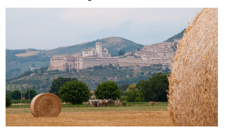
Assisi: home of St. Francis