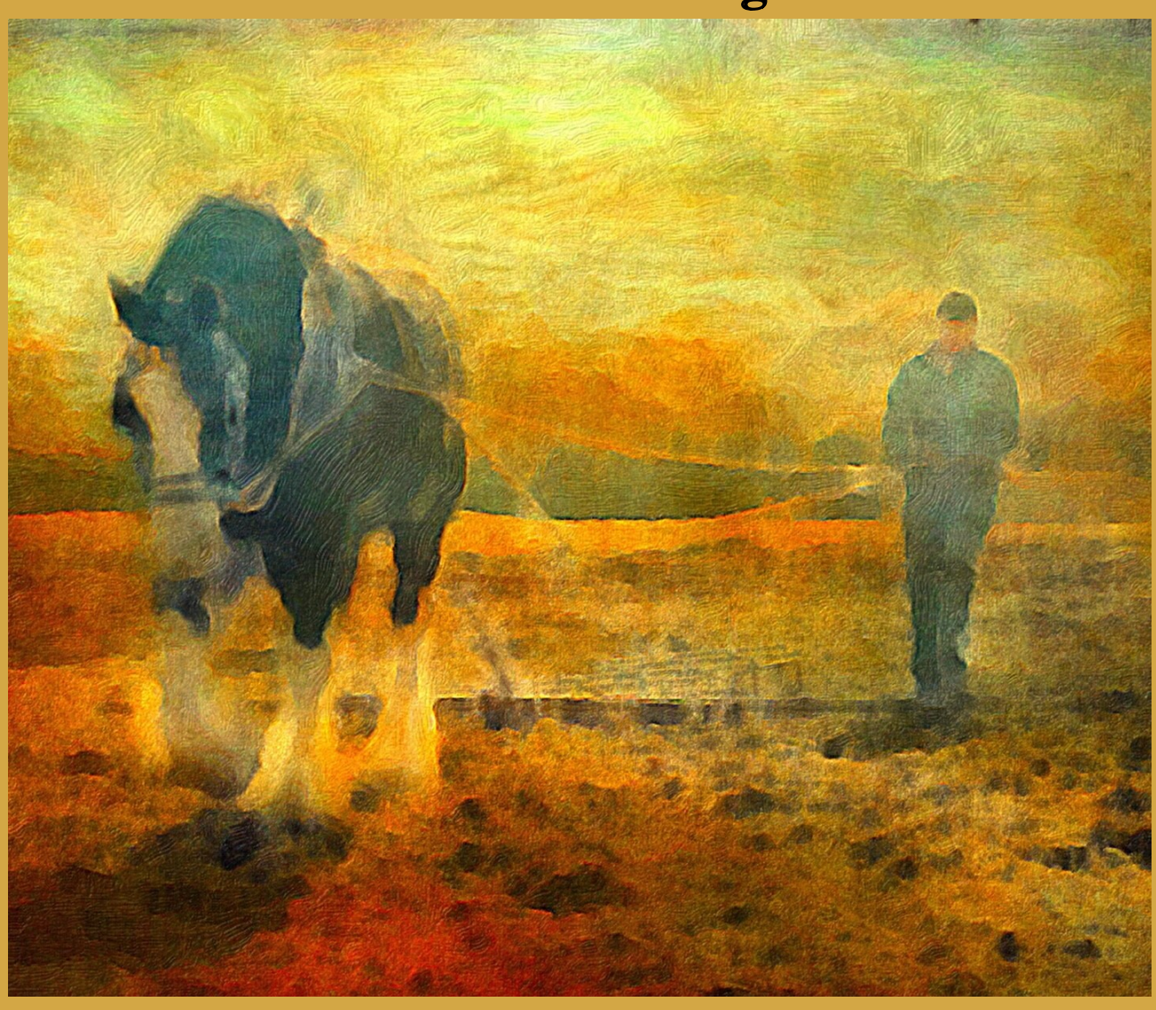
Jesus said, "No one who sets a hand to the plow and looks to what was left behind is fit for the kingdom of God." (Lk 9:62)