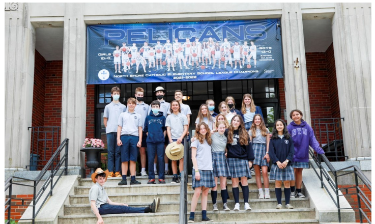
Pictured, the players see the banner for the first time just hours before their graduation.

Although the varsity players are well into their summer vacation, buzz about the banner continues. Everyday, pedestrians walking past the school stop to look at the banner. Washington Street is a familiar walking path for local teens as they come and go from town, who pause to mention the players they know and take a picture of the banner on their phone. Prospective families who arrive at the school for tours are greeted by the banner and are impressed. Recently, a soon-to-be dad, who was just walking by, skipped up the front stairs, rang the bell, and announced that he wanted to enroll his daughter. "I definitely want my daughter to go to school here when she is old enough," he remarked.