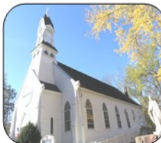
St. Ann, W. Newbury

Selection of candidates for expiring terms will be chosen by lot in late August.