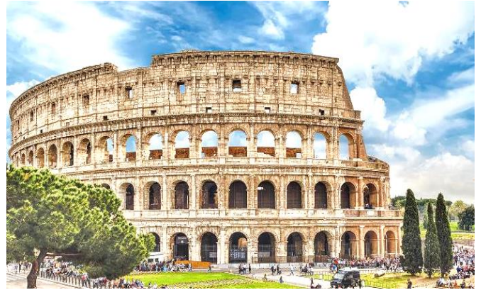
Colosseum ~ Rome

This morning attend an Audience with Our Holy Father, Pope Francis. Afterwards, tour the remnants of "Ancient" Rome. Visit the Catacombs and see the legendary Trevi Fountain and the mighty Colosseum. (B,D)