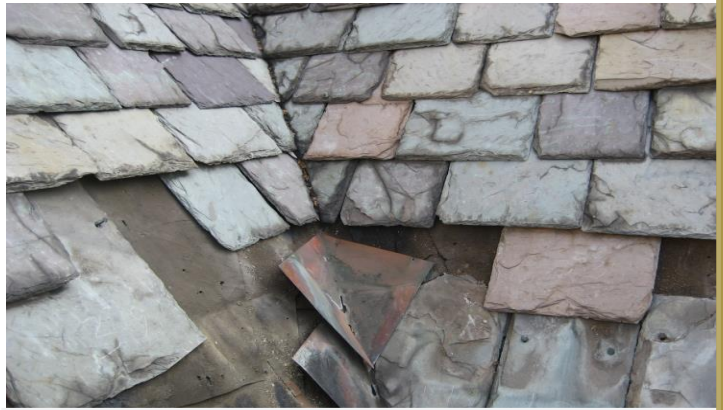
View of roof needing repair

analysis was conducted by the Archdiocesan Office of Property Management Administration of the physical condition of the church, school, rectory, annex and convent. Following this assessment, it became clear that there are significant issues that require attention, in addition to ones that are clearly visible. We must make these capital repairs and improvements or risk further damage and the safety of the buildings. Superstorm Sandy compromised the roofs of