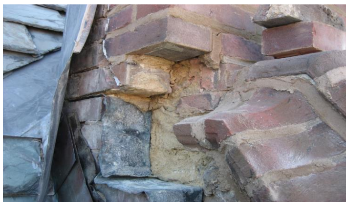
View of masonry needing repairs

There are additional projects that are not critical structural needs but will maintain our buildings and make our church more welcoming to our parishioners and guests. If the campaign raises monies in excess of the funds needed for the vital projects above, other renovations can be done as well.