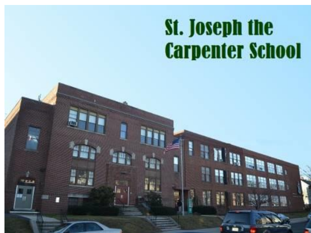
St. Joseph the Carpenter School

We look to the members of our church family to reflect on the efforts of past generations who, through their personal sacrifice, have enabled us to worship and grow in our faith. We now call upon our parish family to support these repairs and renovations with the same enthusiasm and generosity that our predecessors have done for the last 118 years.