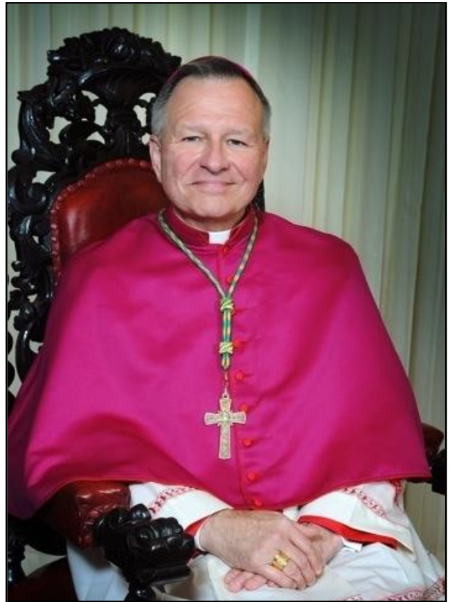
Archbishop Gregory Aymond Archbishop, Archdiocese of New Orleans