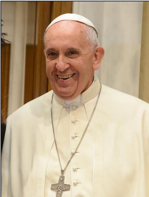
Pope Francis Bishop, Diocese of Rome (Italy) and Pope of the world-wide Catholic Church